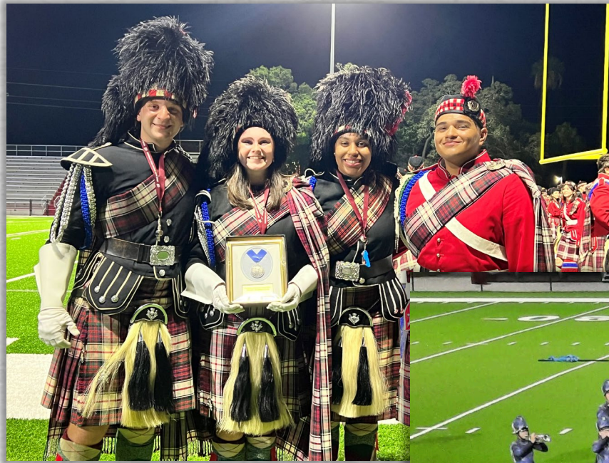
RHS Marching Band