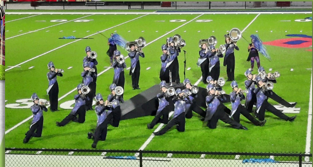
NPHS Marching Band